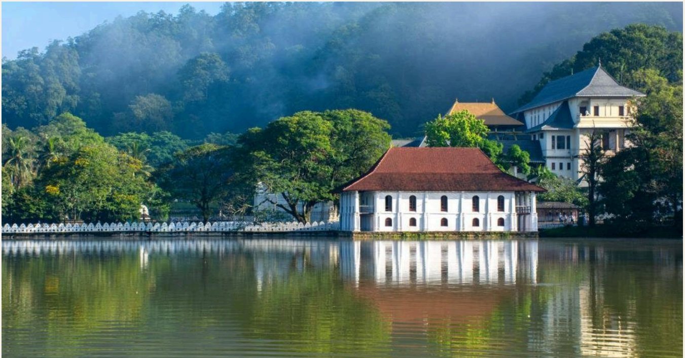
Temple of the Sacred Tooth Relic (Sri Dalada Maligawa), Kandy

In the late afternoon, we depart Kandy and continue our ascent through spectacular tea plantations and misty mountain passes to Nuwara Eliya (approximately 3 hours), where we settle into our hill country hotel for a four-night stay.