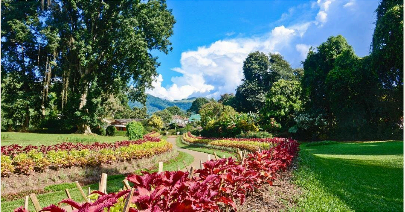
Royal Botanical Gardens at Peradeniya

Overnight: Nuwara Eliya (hill country hotel)