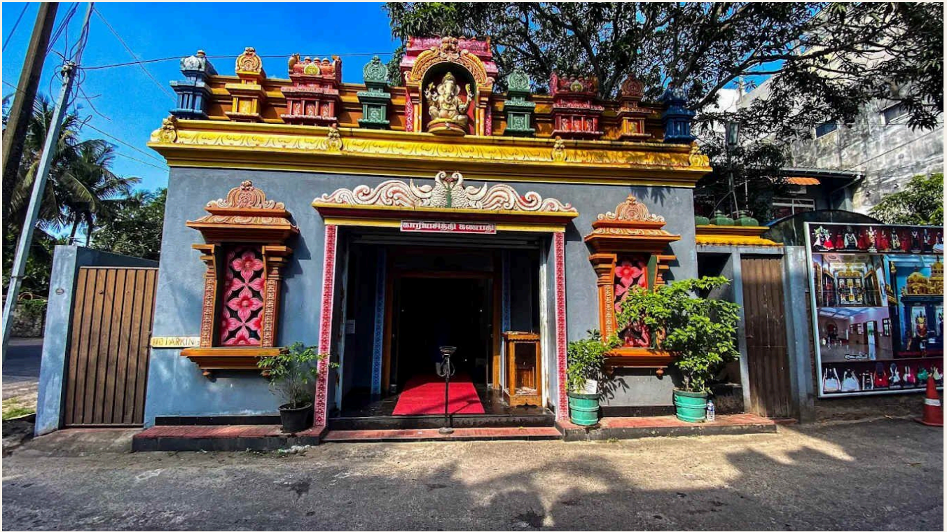
Aishwarya Lakshmi Amman Kovil, Colombo