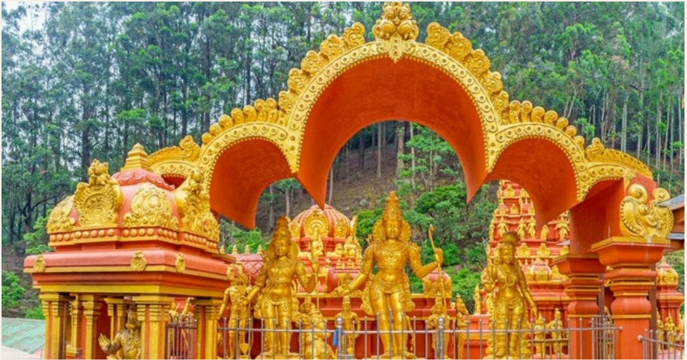
Seetha Amman Temple, Nuwara Eliya

Overnight: Nuwara Eliya (hill country hotel)